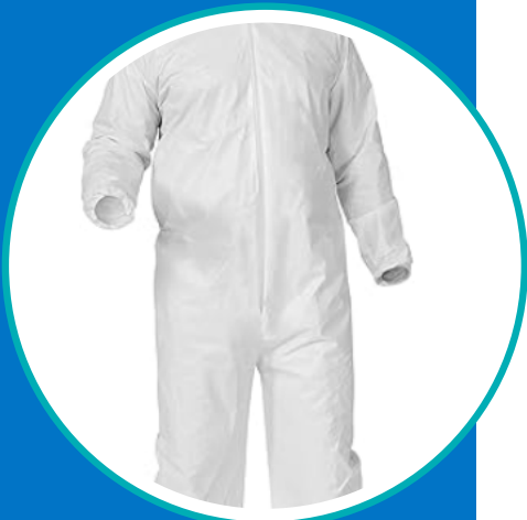
Non woven coverall