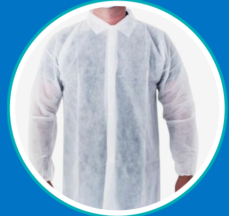
white disposable lab coat