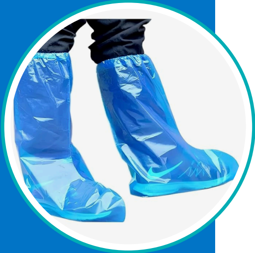
Long shoe cover