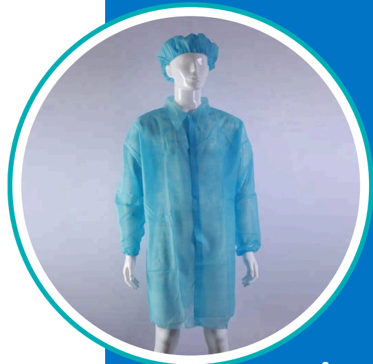
Surgical gown & cap