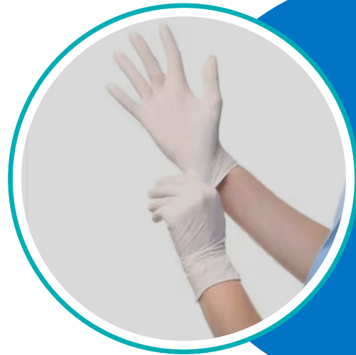
Latex Examination Gloves