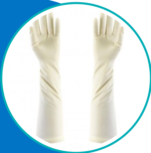
16-inch latex Sterile Gloves