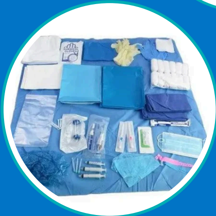
Disposable delivery kit