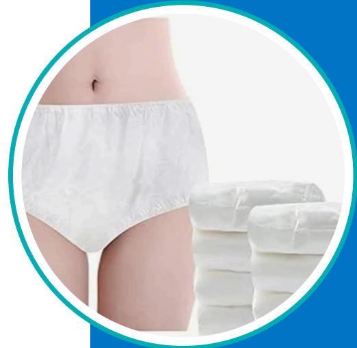
Disposable spunlace panty.