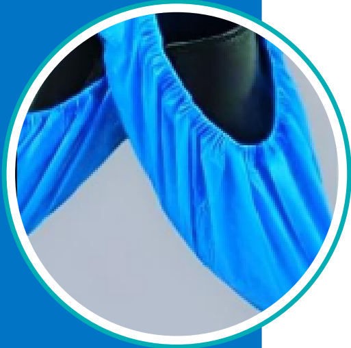
Shoe Cover Plastics