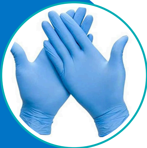
Nitrile Examination Gloves